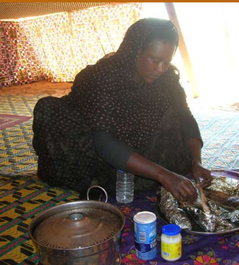
The small local fish restaurants, which sometime produce small quantities of bottarga, can be involved in the project, offering their customers a quality product