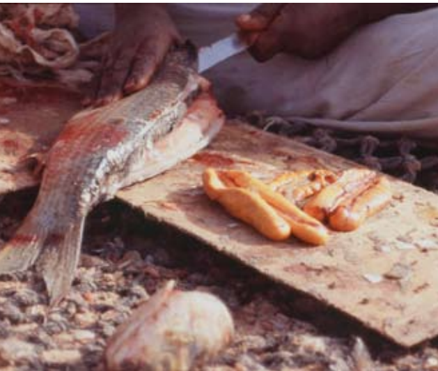
The traditional extraction of the bottarga from the mullet along the coast of Mauritania. The work is done on the ground with limited concern for hygiene and safety.

- 2 Cooperatives, composed of about 30 Imraguen women from the Nouadhibou area and the Banc d'Arguin, produce the fish products and, in particular, they produce bottarga with the eggs of the red mullet. The women of the Cooperatives are the nucleus of the Presidium.