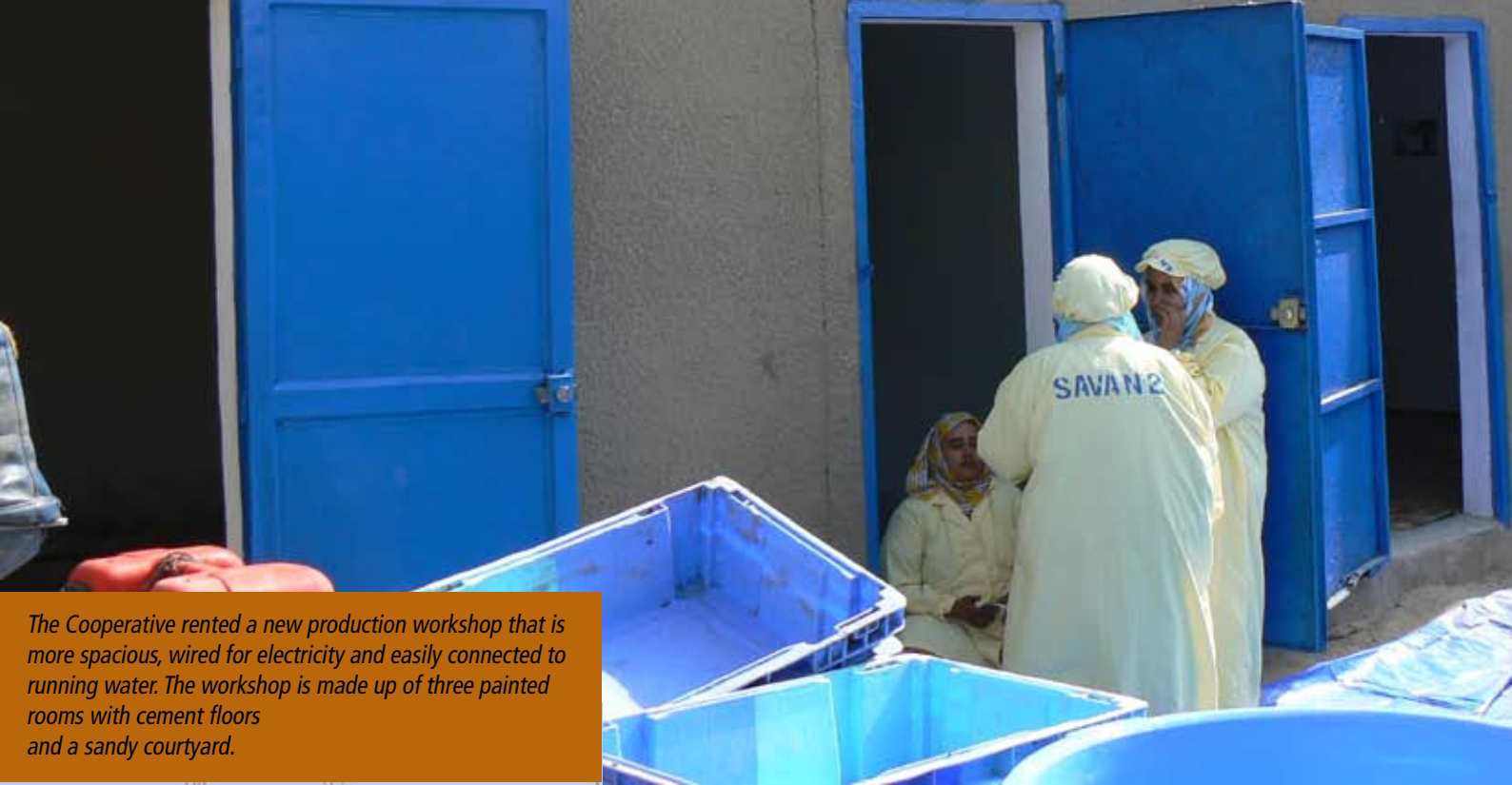
The Cooperative rented a new production workshop that is more spacious, wired for electricity and easily connected to running water. The workshop is made up of three painted rooms with cement floors and a sandy courtyard.