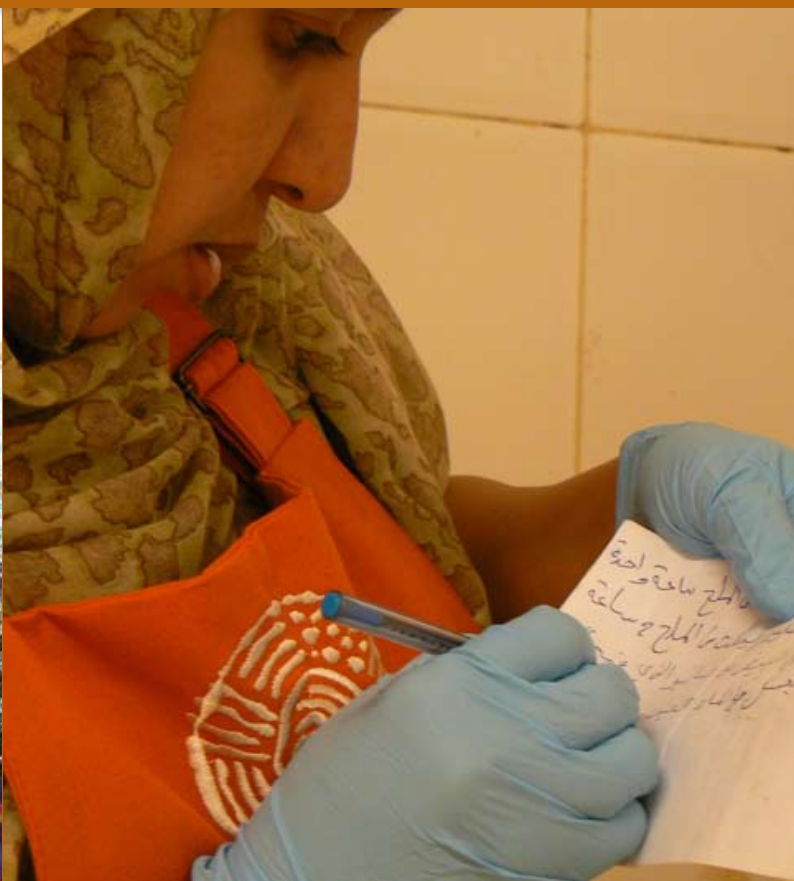
Through the founders of Mauritanie2000 who participated in the work, the proper techniques can be shared with other cooperative.