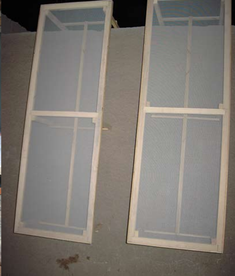
Between activities, four frames were constructed for the drying process, using mosquito netting brought from Italy and the artistry of a local carpenter