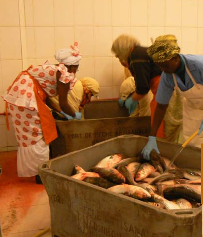
The fish are cleaned, to limit the damage caused by transportation from the boats, trucks and containers to the workshop