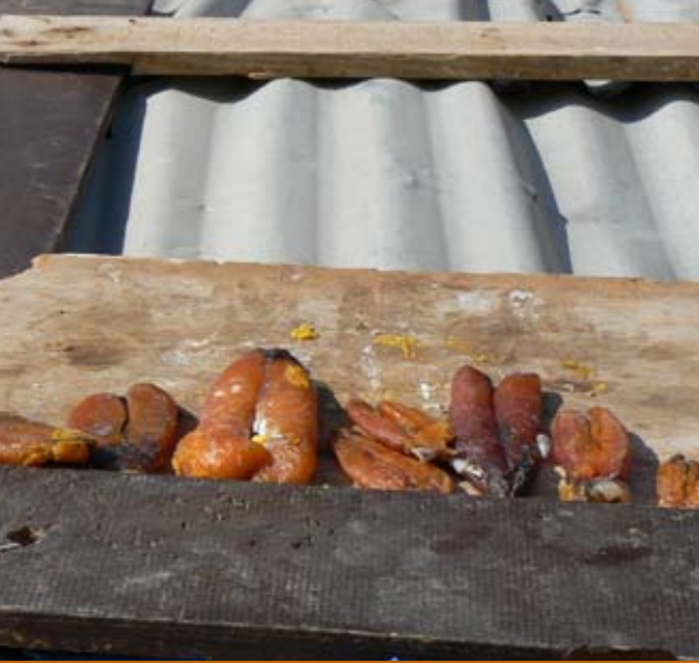
The bottarga for personal consumption and for the local market is dried under the sun in the open air on boards and tables set on the sheet metal roofs of their houses