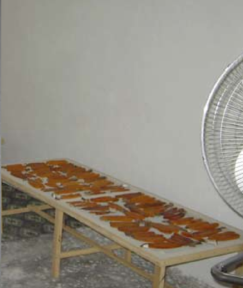
Once dried, the bottarga is vacuum-packed using a small domestic machine