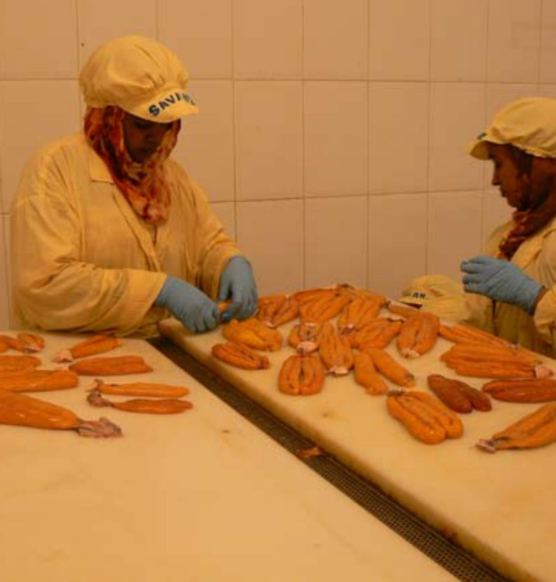
A greater amount of salt is now being used. The production uses a large grain salt from Spain, imported by a local fish producer