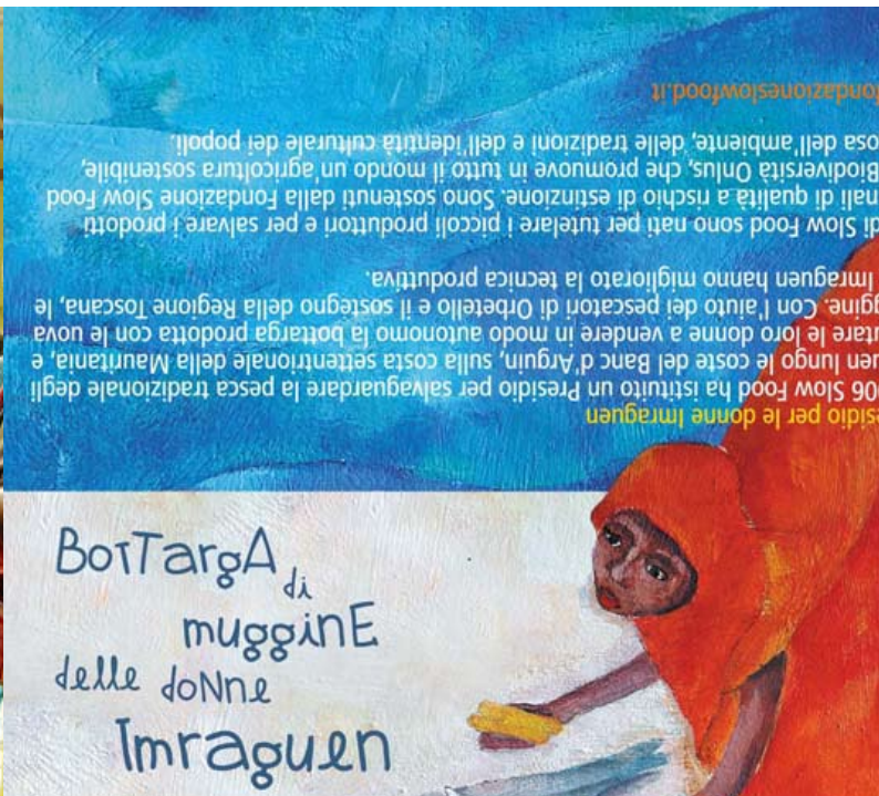
The label of the bottarga sold at Salone del Gusto