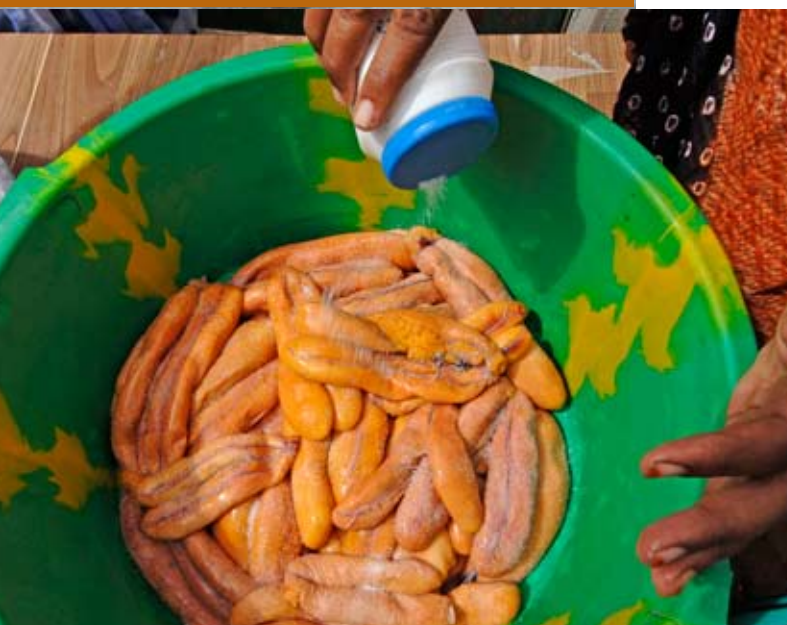
Furthermore, the traditional production uses a minimum amount of salt, risking bacterial contamination

- The NGO Mauritanie2000, begun in 1994, is the Presidium's local partner, given the common interests and activities between their own program ("Femmes et Peche") and Slow Food's project.