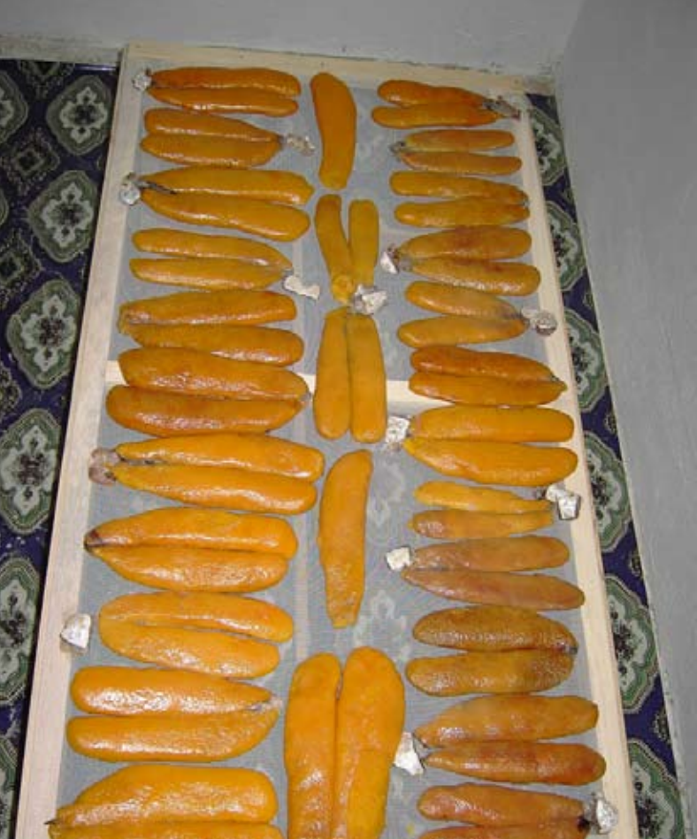
The drying takes place in one of the rooms of the new workshop, which has been sanitized and equipped with a fan to circulate the air