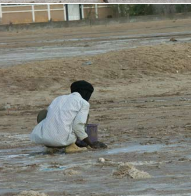
The local salt is not suitable for a quality production